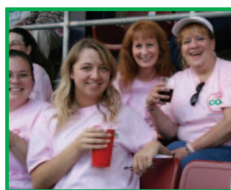
CorePlus team members all had a great time