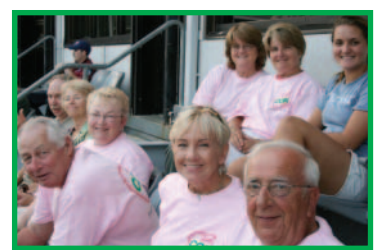
Many CorePlus board members wore their pink shirts. Pink shirts were given to the first 1000 at Dodd Stadium.